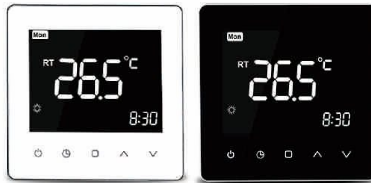
TP528 Heating Series