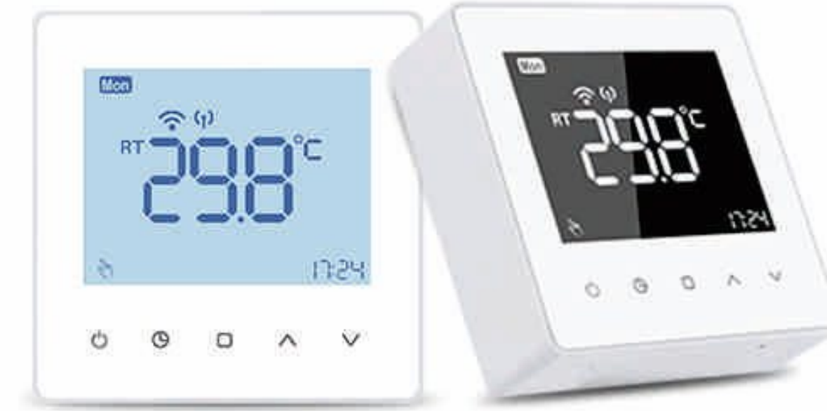
Tp608 (white LCD)/TP618 (VA LCD)